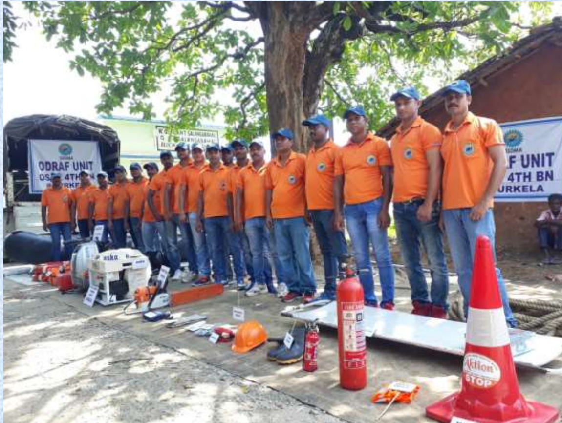
Well equipped Odisha Police ODRAF team, located throughout the State Odisha Disaster Rapid Action Force created in 2001